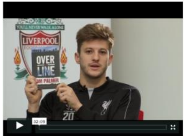
Liverpool FC Adam Lallana

Click here for more http://tompalmer.co.uk/over-the-line/